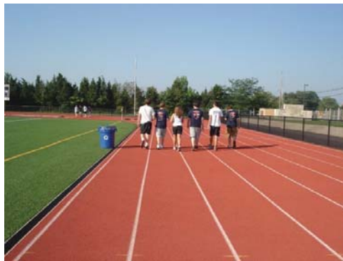
Team members at the Walk-A-Thon

supporters who brought water, snacks, and other drinks. The team stayed hydrated and cool all day long even though the walk took place in the smoldering heat. All in all, the Walk-a-Thon was a success and the team