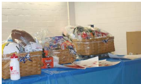
Baskets at the Basket Bingo

Cyberonics Team 103 just finished one of their biggest and most successful fundraisers, the annual Basket Bingo. The bingo was held on October 25, 2009 at Palisades High School. Every year, the Basket Bingo really helps Cyberonics. It is a huge fundraiser that requires many hours of preparation and a whole lot of teamwork.