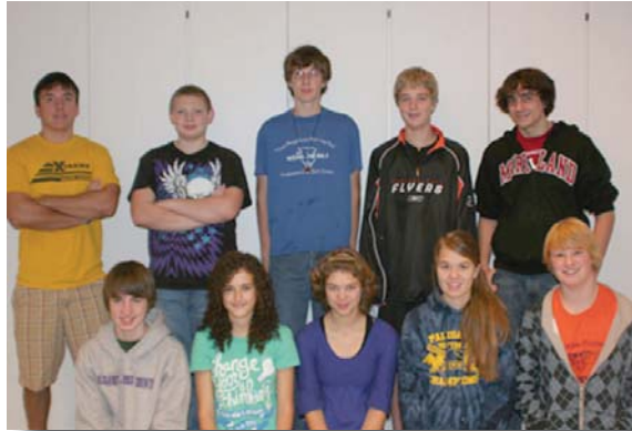
The "Newbies" in Cybersonics